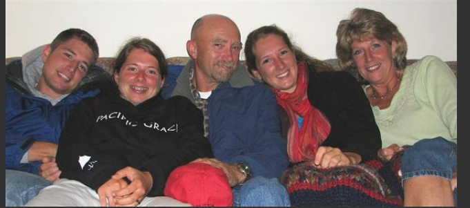
The Harmsworth crew