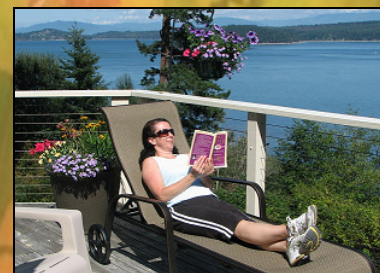
Guests enjoy relaxing on the deck

■ 24 guests this month, 3 first-time ministry recipients, 3 weekend ‘intensives.’