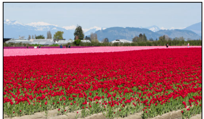
Skagit Valley tulips blooming near us.