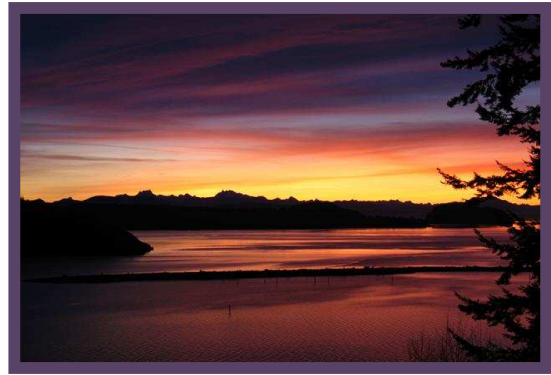
February sunrise from our deck

We would be encouraged to hear from you: at our mailing address (see below) e-mail: neil@noblemaritime.com home phone: 360-682-6230 cell : 360-774-1180 (Neil) 360-301-3937 (Kathy)