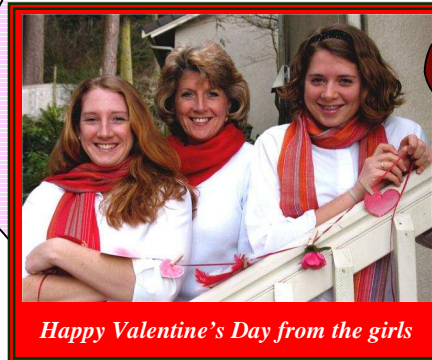
Happy Valentine's Day from the girls