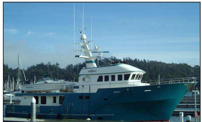
MV Atlas – for sale in Anacortes