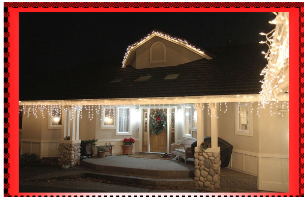
Our home for the holidays