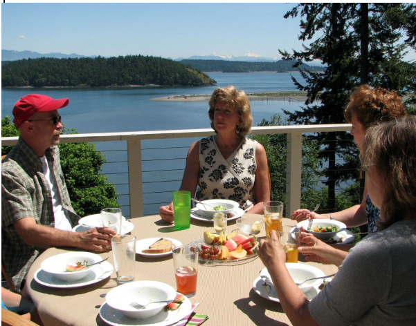
Eating on the deck with guests! Spring is here!

Quotable quote: “Insecurity is simply wrong security exposed” Bill Johnson