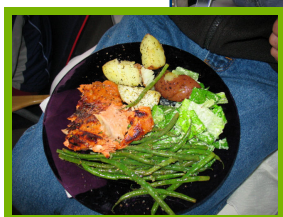
How about fresh salmon from the BBQ with roasted red potatoes and seasoned green beans?

“I’ve had two [prayer ministry] sessions ... I’m amazed at how God can enter any of those memories and rebuild His truth about who I am and who He has created me to be. I am looking forward to walking in this new light and new revelation and seeing how this changes my relationships with my mom, my girls and my husband. It has been incredible scenery and rejuvenation; a time to reflect. It’s just been great. I’m really grateful for this opportunity.”