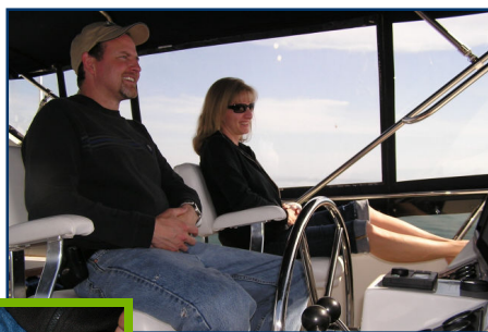
Enjoying the view from the flybridge